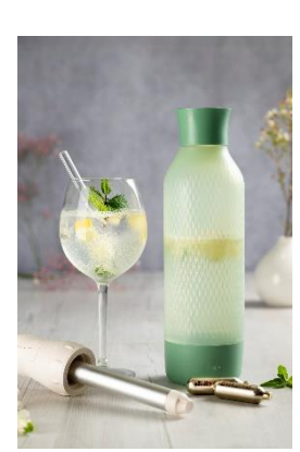
iSi Hugo Bliss