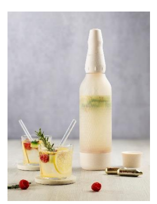
iSi Sparkled Infused Water