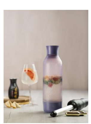
iSi Sake Spritz