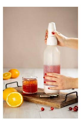
iSi Sparkling Cranberry Negroni