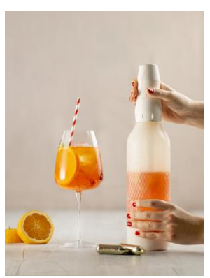
iSi Aperol Spritzzz