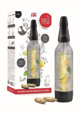
iSi Twist'n Sparkle Virtuoso Starter Set Onyx