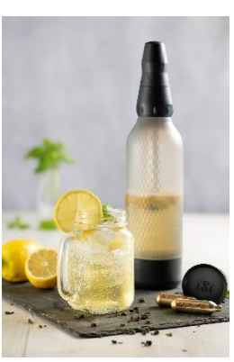
iSi Fizzy Iced Tea